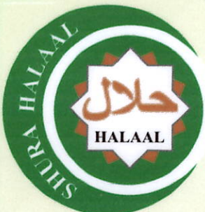
TRUSTEE SHEIGH NAZEEM SAFODIEN