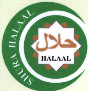
TRUSTEE SHEIGH NAZEEM SAFODIEN